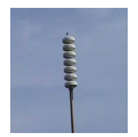
Two types of warning sirens you will see in Hinds County