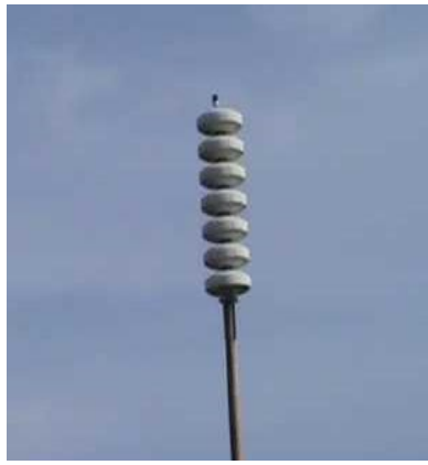
Two types of warning sirens you will see in Hinds County