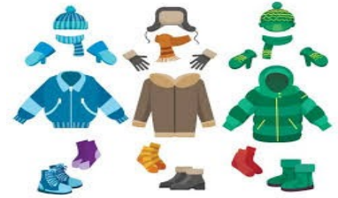
Warm clothes, loose layers

Vehicle maintenance is also very important during winter weather. You should check the antifreeze and oil levels and be sure your brakes, battery, lights, heater/defroster and tires are all in good working order especially prior to a road trip. It is also a good idea to have preparedness kit in your car including: windshield scraper, flashlight, battery powered radio, extra batteries, water, snacks, matches, first aid kit, pocket knife, blanket, booster cables, flares, hats, socks, mittens, medications and rope or tow chain.