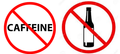
Avoid if you suspect you have frostbite or hypothermia