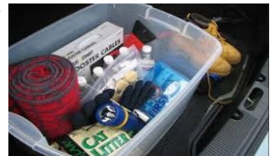
Vehicle Emergency Kit

Find us on Facebook at www.facebook.com/Hinds EOC